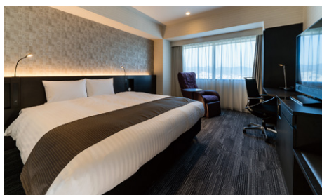
Deluxe Double Room (28.6m²)