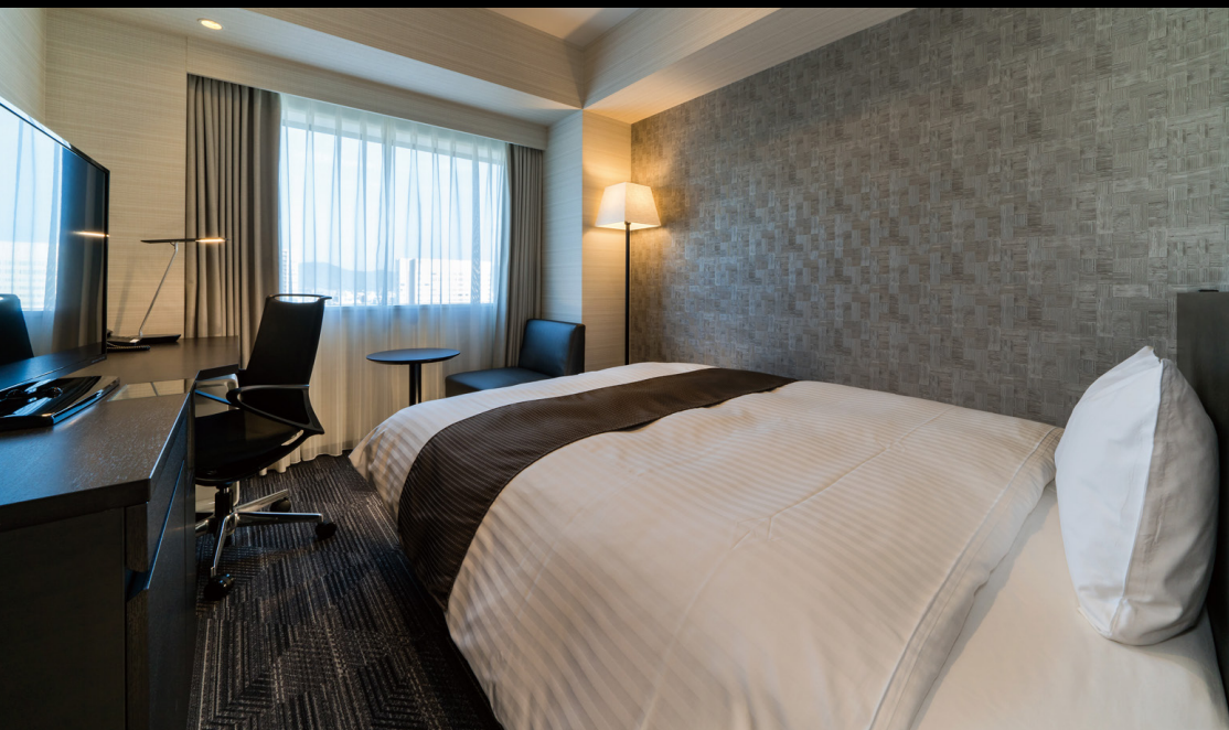
Moderate Double Room (21.5m²)