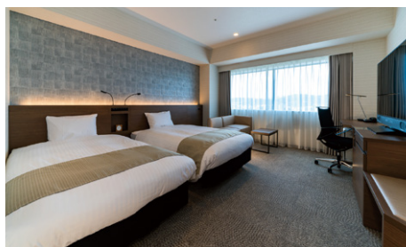
Moderate Twin Room (30.8m²)