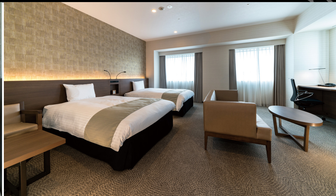
Executive Twin Room (44.5m²)

Amenities for ladies (available at the front desk) / Amenities for kids (available at the front desk)