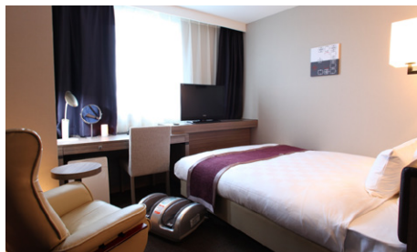
Ladies Room (20m 2 )