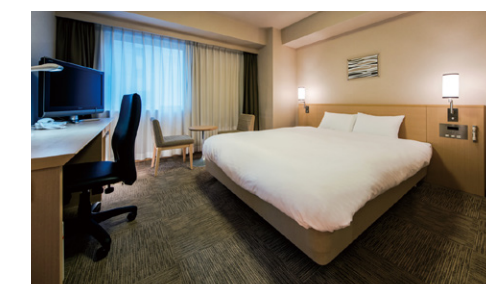
Deluxe Double Room (25.4m<sup>2</sup>)

We also have universal twin rooms (28.6m<sup>2</sup>).