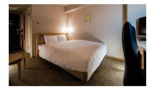
Standard Double Room (18.2m²)