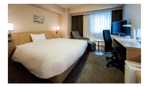
Relax Room (25.4m²)