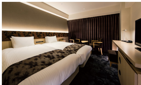
Standard Twin Room (23.7m 2 )

Facilities and amenities (Our lobby and guest rooms are decorated with luxurious Nishijin-ori brocades woven by Hosoo, a prestige company established in the Genroku Era (mid-Edo Period, 1688 to 1704.)