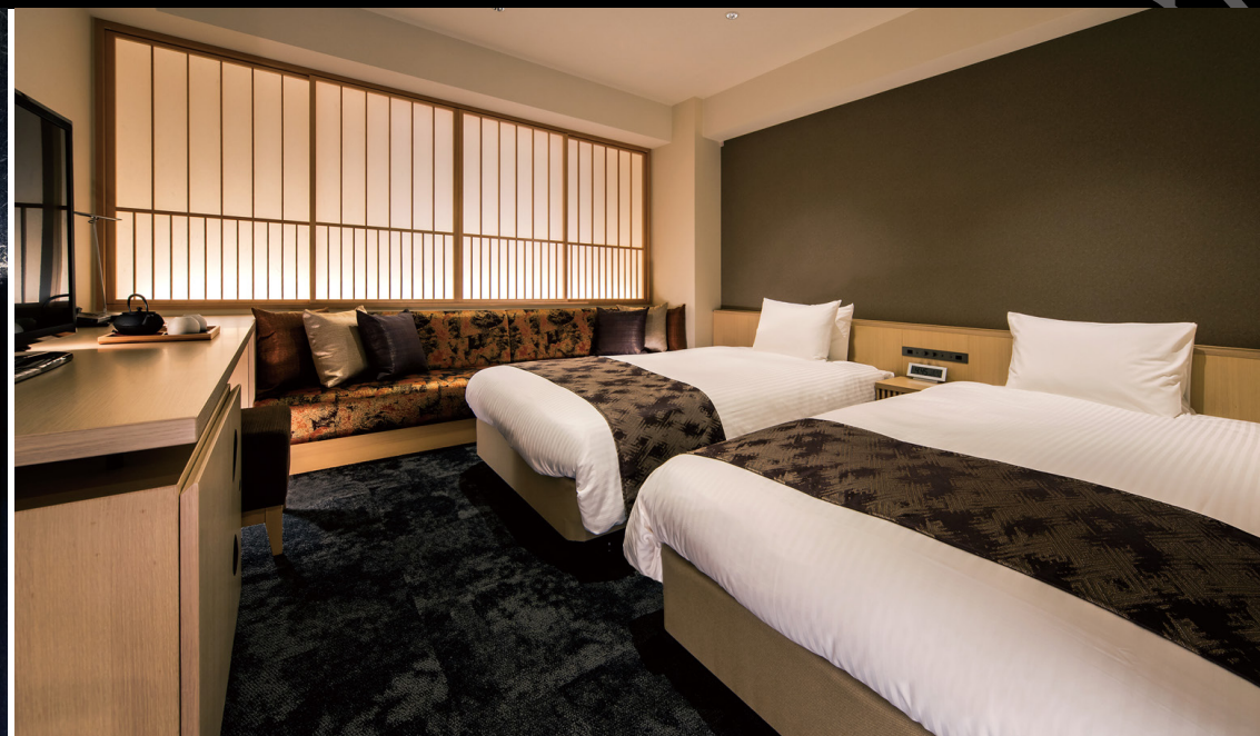
Superior Twin Room -Miyabi- (24~26.6m 2 )

Amenities for ladies (available at the front desk) / Amenities for kids (available at the front desk)