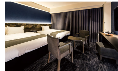
Deluxe Twin Room (30.9m 2 )

Other types of rooms: Executive double (40.1m 2 ), Ladies twin (31m 2 ), Universal double (23.9m 2 ) / Total 205 rooms