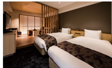
Executive Twin Room -Hana- (36.2m 2 )