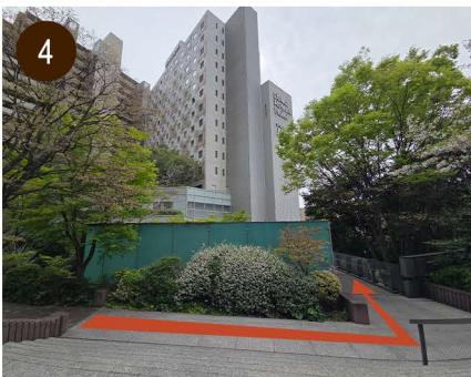
④ If you keep going straight, you will see the hotel on your left. You have arrived.

2-1-3 Osaki, Shinagawa-ku, Tokyo 141-0032