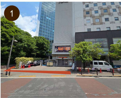
① With the hotel in front of you, turn left.