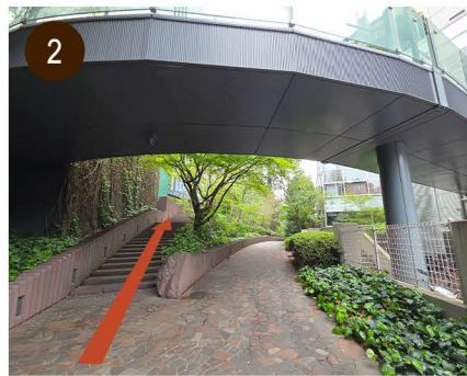
② Take the left fork and continue up the stairs.