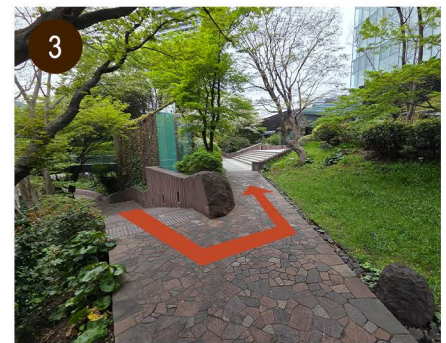
③ Once you reach the top of the stairs, turn around and follow the path straight ahead.