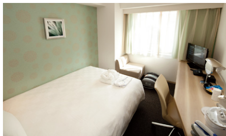
Ladies Room (17m 2 )