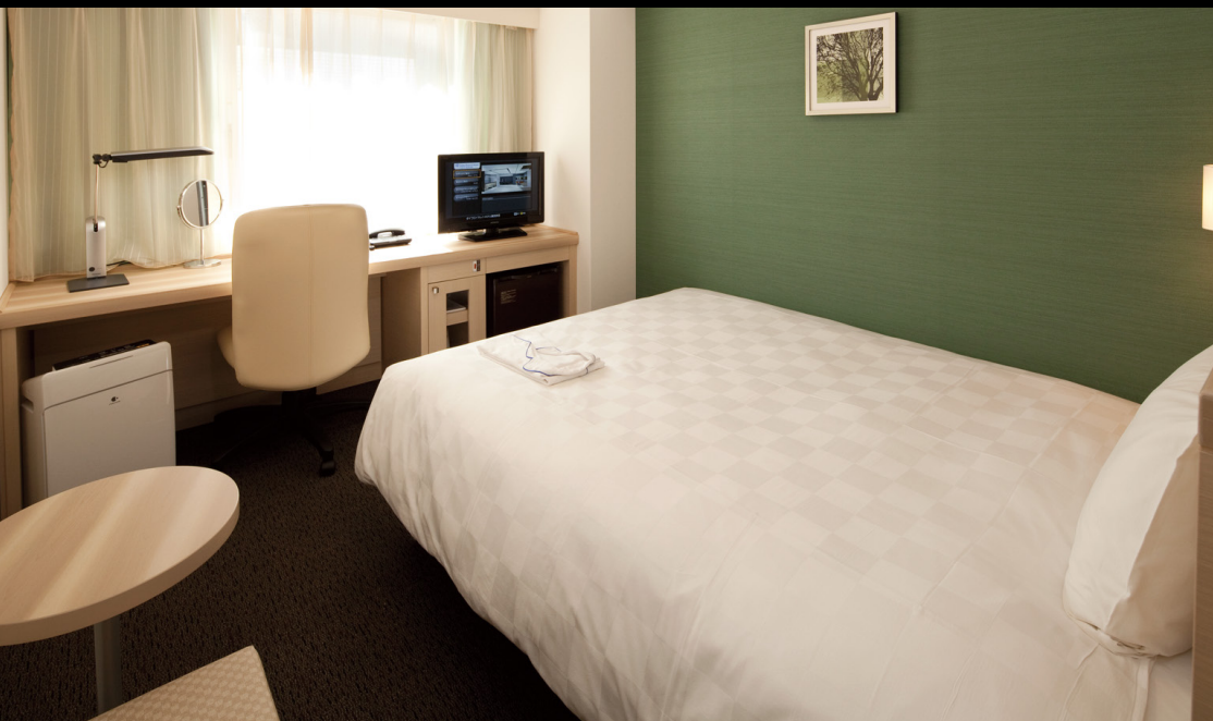
Single Room (17m 2 )