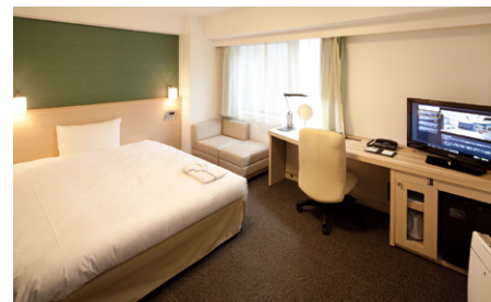
Universal Room (26m 2 )