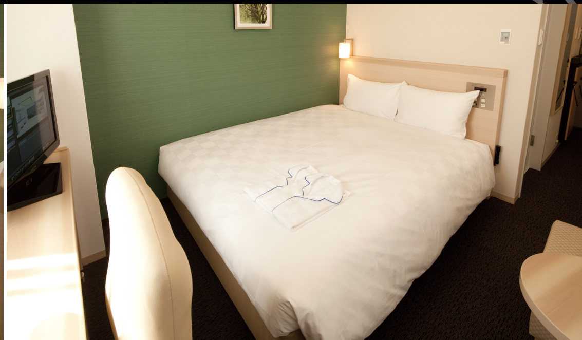
Double Room (17m 2 )

Amenities for ladies (available at the front desk) / Amenities for kids (available at the front desk)