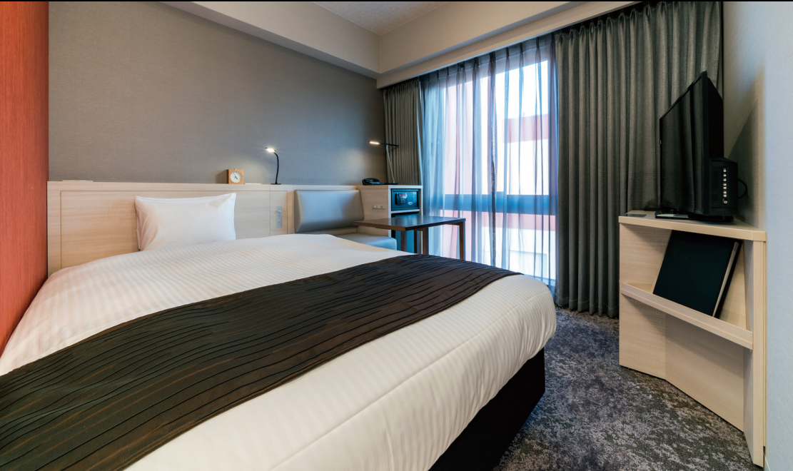
Standard Room - Basic - (15m 2 )