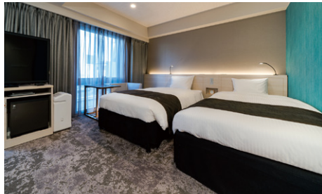
Twin Room (21m 2 )