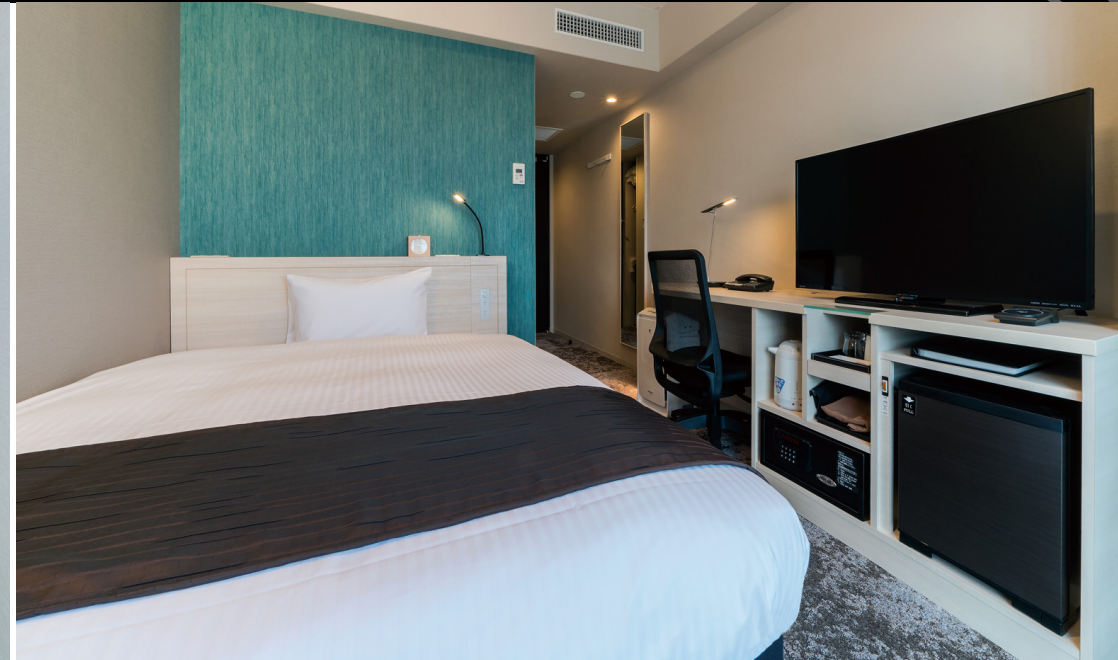
Standard Room - Smart - (15m 2 )

Amenities for kids (available at the front desk)