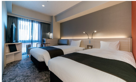
Universal Twin Room (30m 2 )