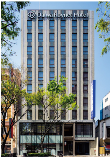
DEL style 福岡西中洲

Our standard rooms are 15 m 2 , which is slightly smaller than other Daiwa Roynet Hotels. Despite their compact size, rooms are functional and stylish as well as conveniently located, with Tenjin and Nakasu within walking distance. A practical user-friendly hotel offering the quality that only a Daiwa Roynet Hotel can achieve.