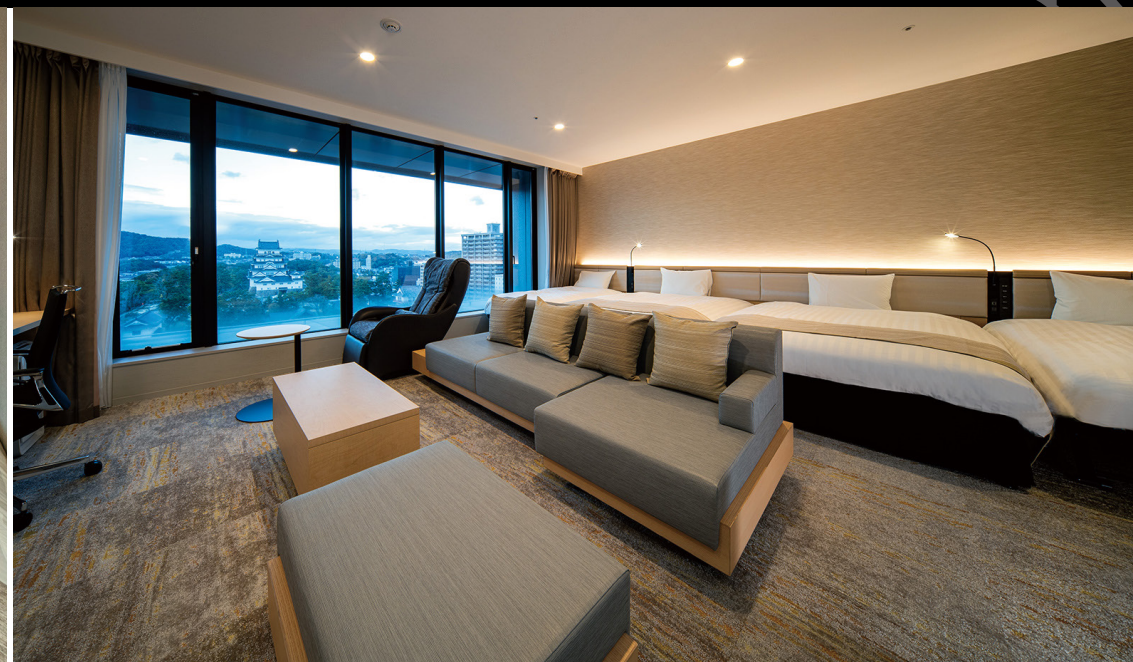
Junior Suite Fourth Room (50m 2 )

Amenities for ladies (available at the front desk) / Amenities for kids (available at the front desk)