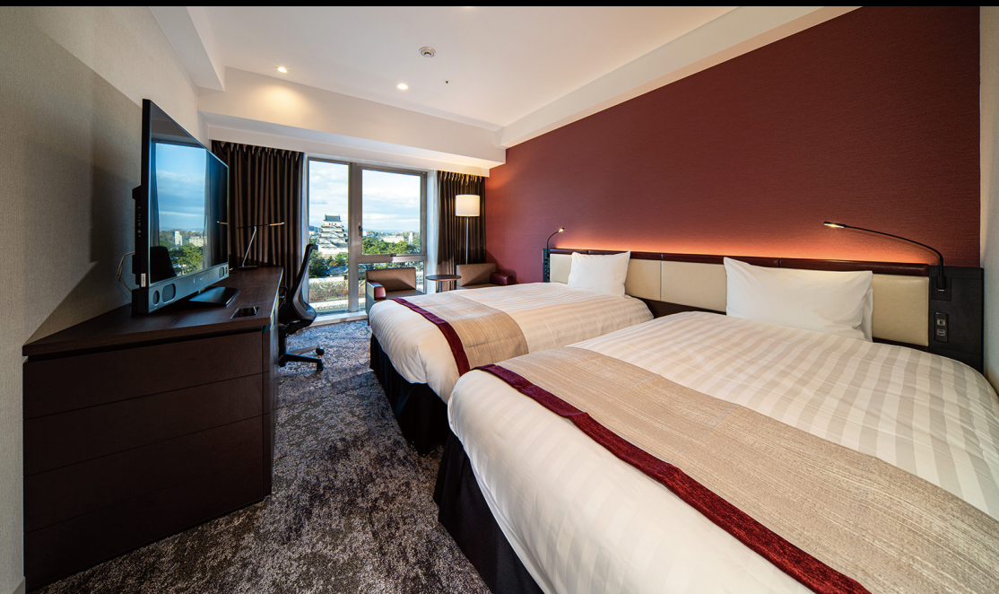
Superior Twin Room (28m 2 )