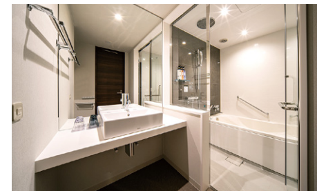
Separate toilet and bathroom (example)

All guest rooms except universal rooms have separate bathroom and toilet. You can enjoy a relaxing bath even when multiple guests are using the room.