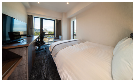
Superior Double Room (22m 2 )