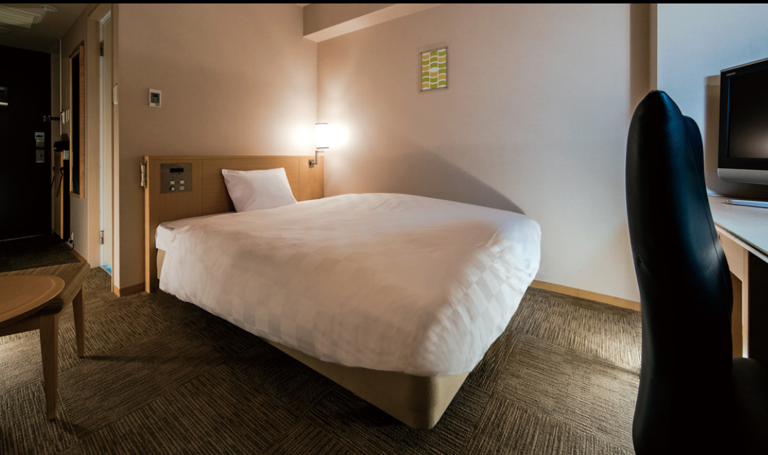
Standard Single Room (18.2m 2 )