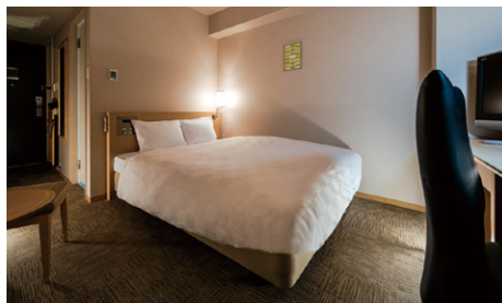
Standard Double Room (18.2m 2 )