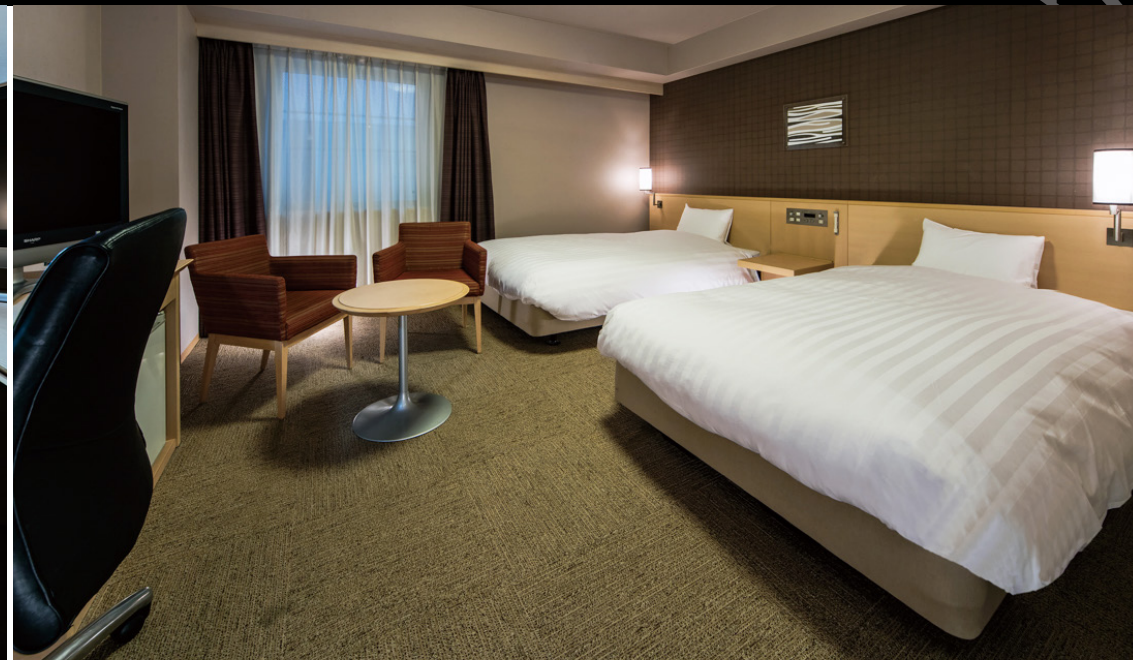
Twin Room (28.6m 2 )

Amenities for kids (available at the front desk)