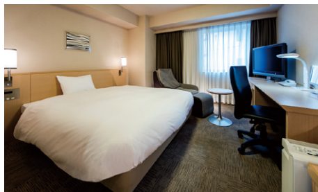
Relax Room (25.4m 2 )