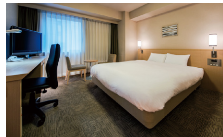
Deluxe Double Room (25.4m 2 )

We also have universal twin rooms (28.6m 2 ).