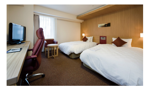
Universal Room (27m²)