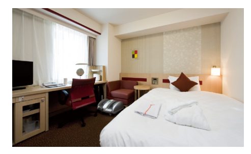
Ladies Room (20m²)