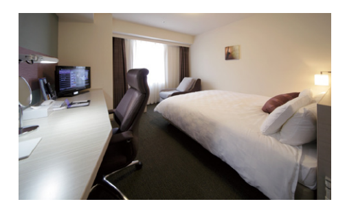
Relax Room (21m<sup>2</sup>)