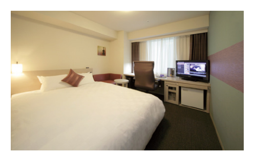
Deluxe Room (20m²)