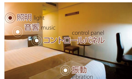
Sleeping Environment System Room (18m 2 )

This room supports sleeping and waking with light, music and vibration when you go to bed and when you wake up.