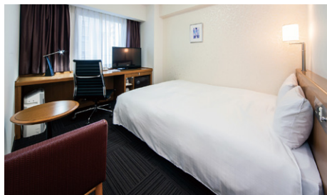
Double Room (18m 2 )