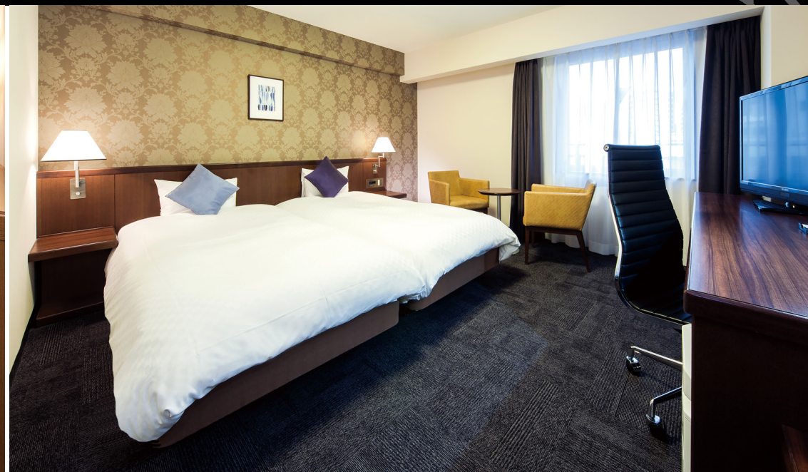
Hollywood Twin Room (27m 2 )

Amenities for ladies (available at the front desk) / Amenities for kids (available at the front desk)