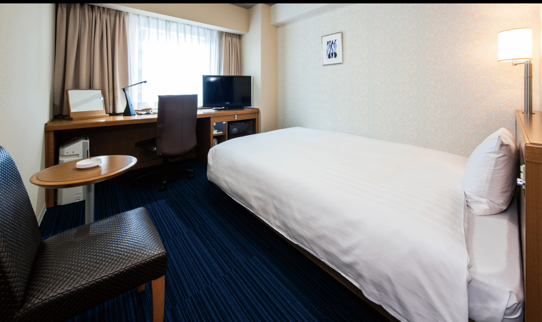
Single Room (18m 2 )