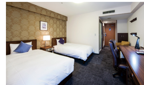
Universal Room (27m 2 )

This room supports sleeping and waking with light, music and vibration when you go to bed and when you wake up.