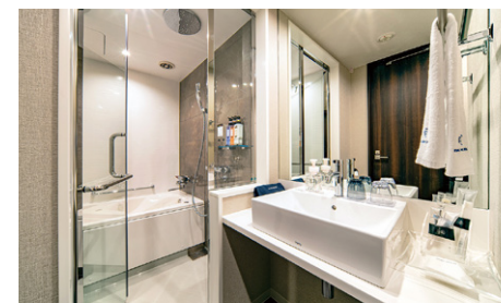
Separate toilet and bathroom (example)

All guest rooms except universal rooms have separate bathroom and toilet. (With a bathtub and a overhead shower.) You can enjoy a relaxing bath even when multiple guests are using the room.