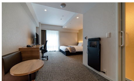
Universal Double Room (32.0m 2 )