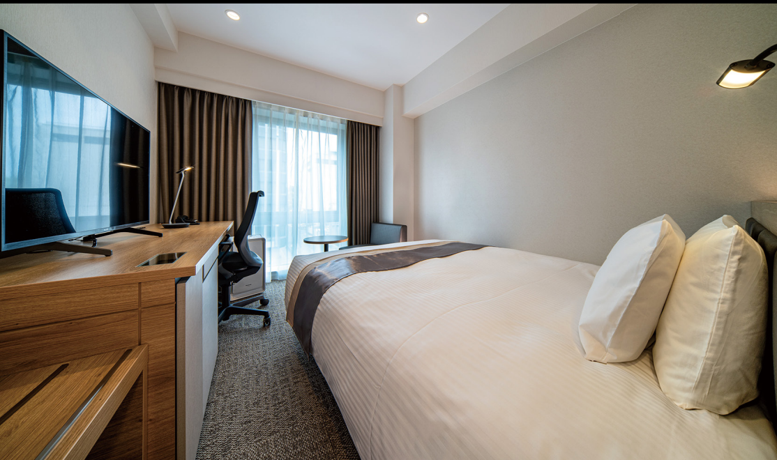
Moderate Double Room (21.0m 2 )