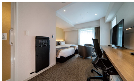
Universal Twin Room (32.0m 2 )