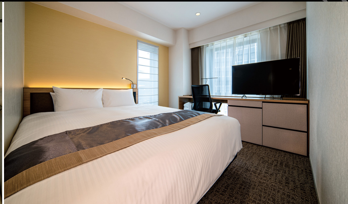
Superior Double Room (23.0m 2 )