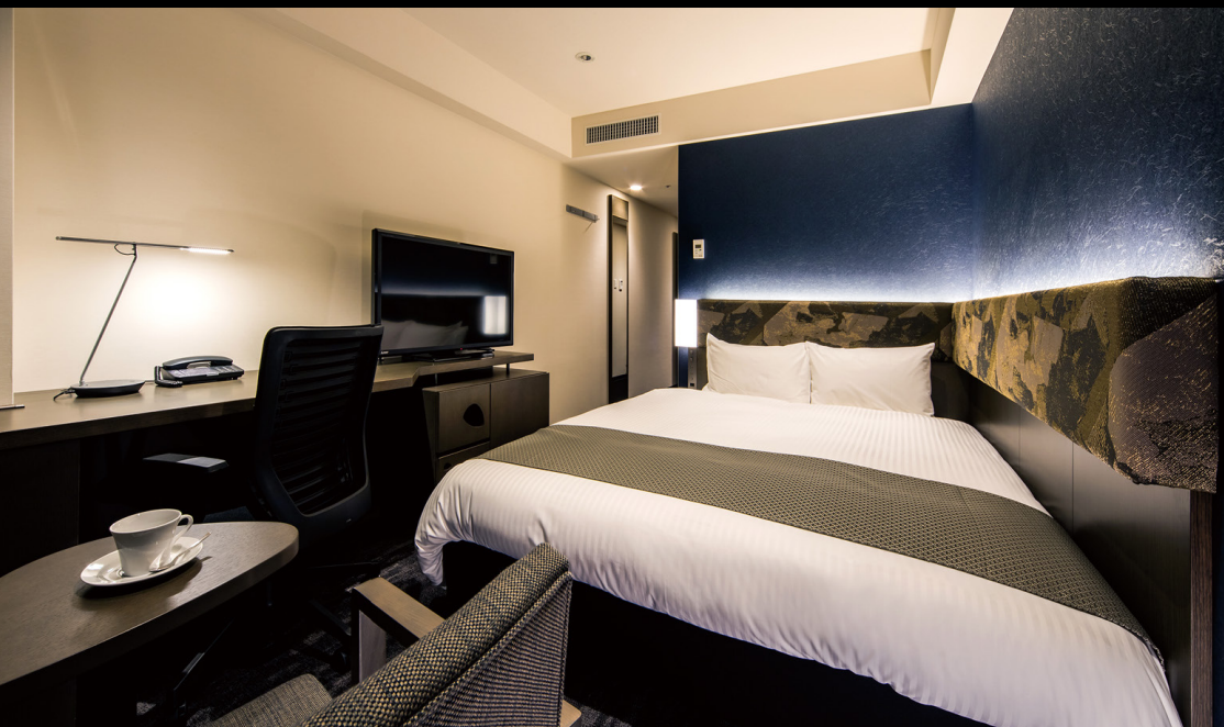
Superior Double Room (20.1m²)