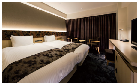
Standard Twin Room (23.7m²)

Facilities and amenities (Our lobby and guest rooms are decorated with luxurious Nishijin-ori brocades woven by Hosoo, a prestige company established in the Genroku Era (mid-Edo Period, 1688 to 1704.)