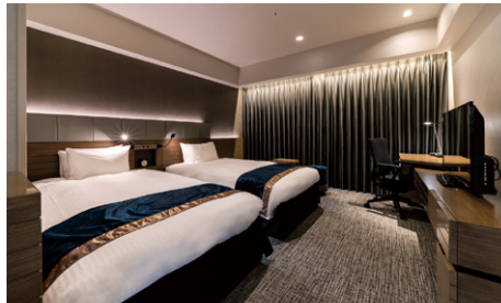
Deluxe Twin Room (27m 2 )