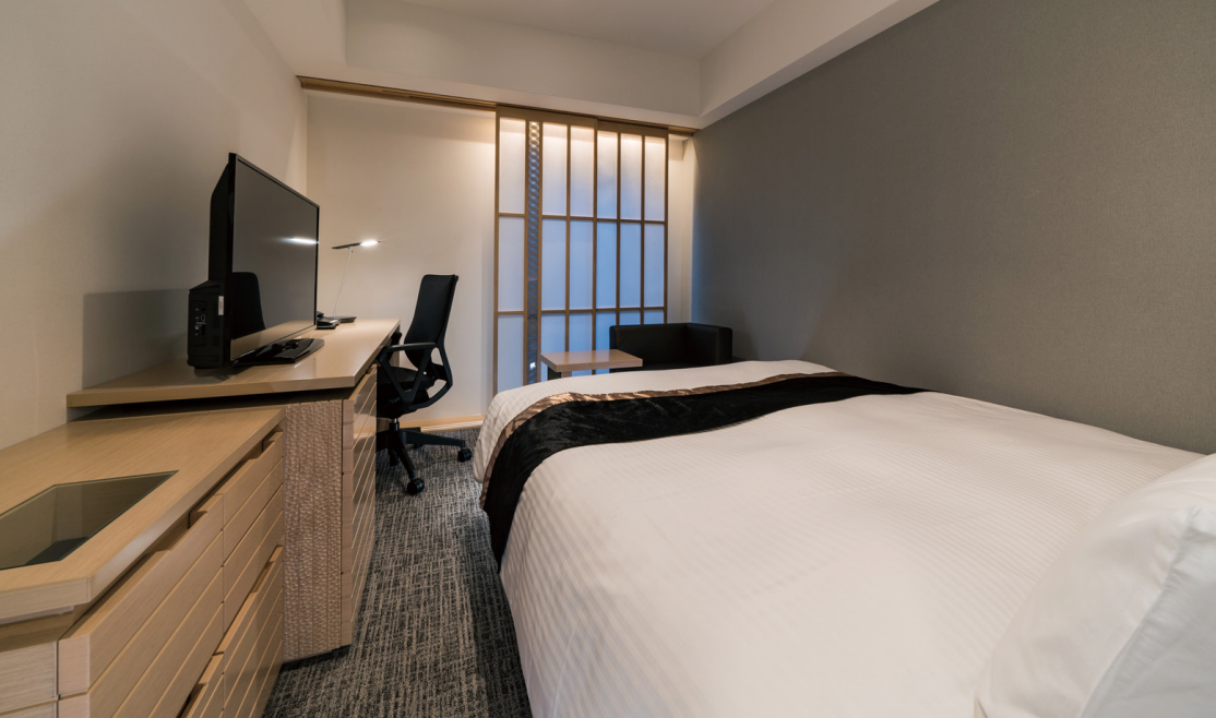
Superior Double Room (20m 2 )