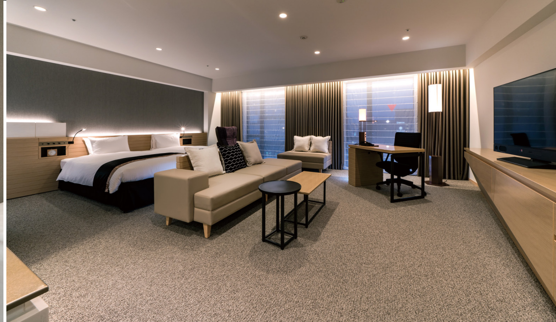
Junior Suite Room (48m 2 )