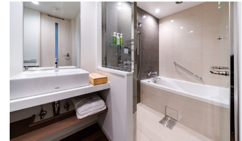
Separate toilet and bathroom (example)

All guest rooms have separate bathroom and toilet (with bathtub and overhead shower)