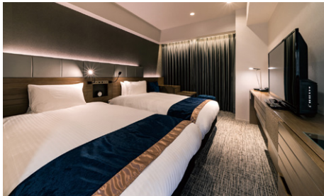
Superior Twin Room (24m 2 )