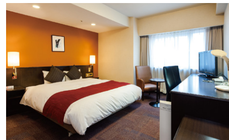
Deluxe Double Room (26.7m 2 )