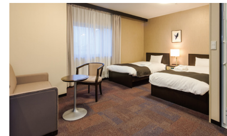
Universal Room (35.8m 2 )