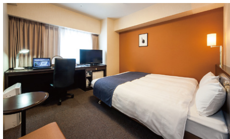
Superior Double Room (21.5m 2 )