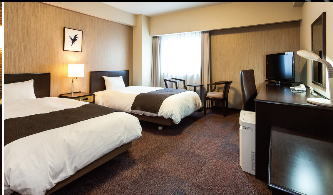
Twin Room (27.3m 2 )