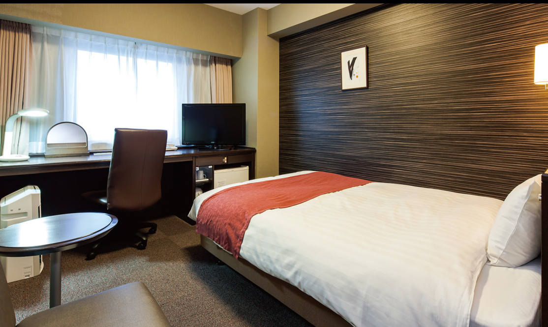
Standard Double Room (18.2m 2 )