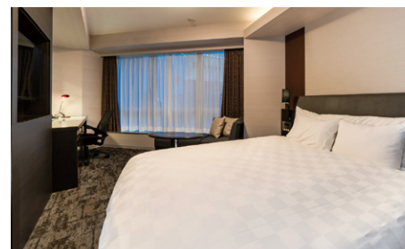
Executive Corner Double Room (23m 2 )