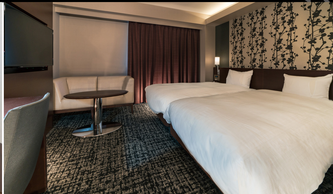
Standard Twin Room (25m 2 )