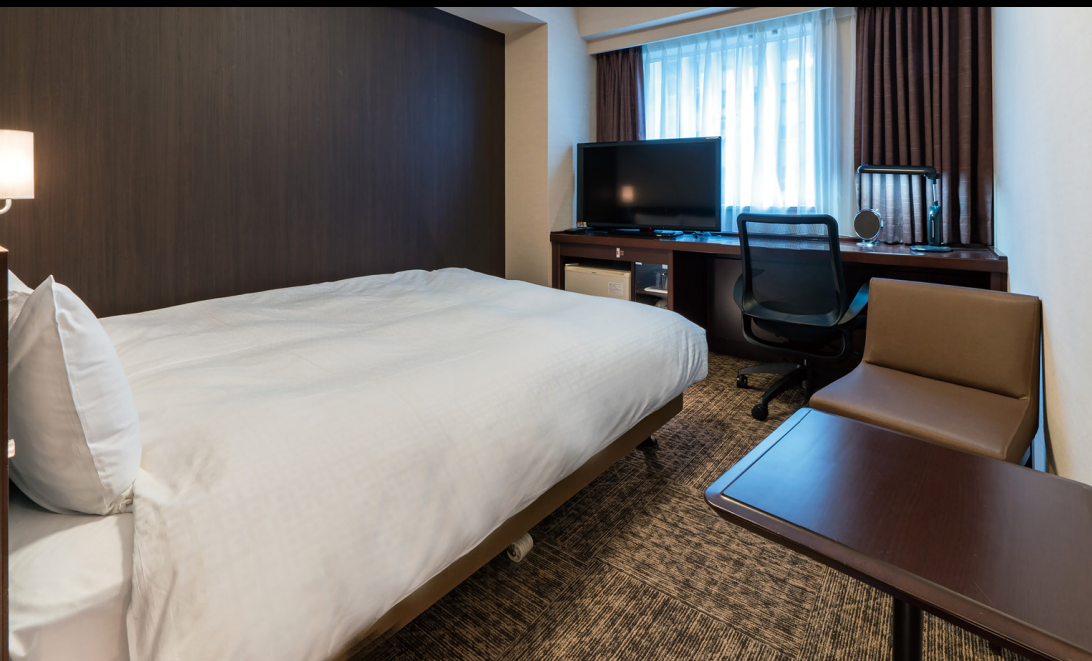
Standard Single Room (18m 2 )