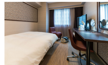
Ladies Room (20m 2 )

We also have Standard Corner Double rooms (23m 2 ), Executive Twin rooms (25m 2 ).