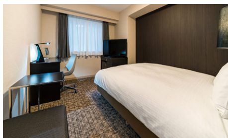
Executive Single Room (18m 2 )