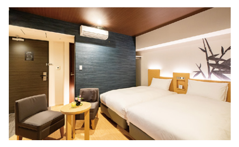
Hollywood Twin Room (24.79m²)