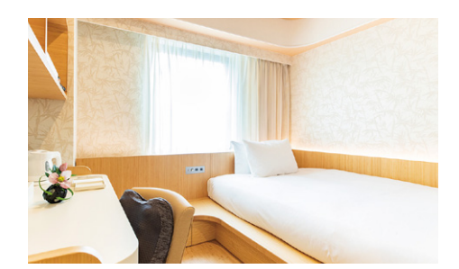
Ladies' Standard Room (14.10m²)