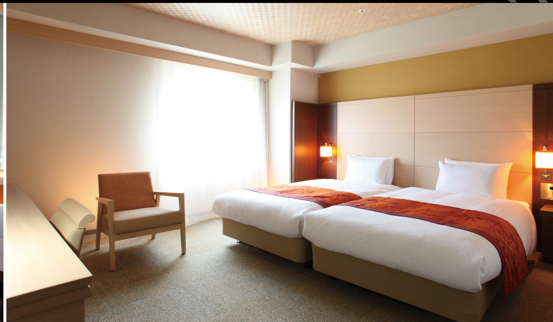
Hollywood Twin Room (29.9m 2 )

Amenities for kids (available at the front desk)