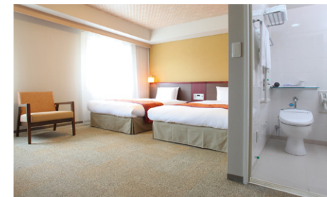
Universal Room (32.5m 2 )