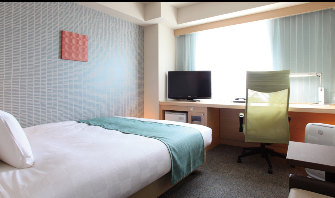
Standard Double Room (18.2m 2 )