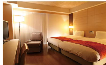
Deluxe Twin Room (27.3m 2 )