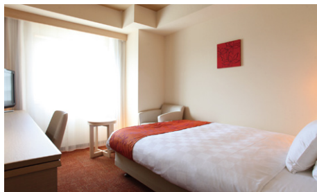
Ladies Room (20.2m 2 )