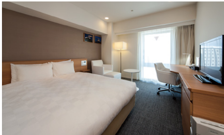
Moderate Double Room (26m 2 )