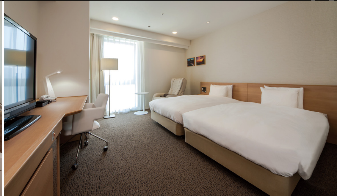
Hollywood Twin Room (30m 2 )