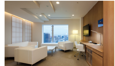
Suite Room (63~67m 2 )

We also have universal twin rooms (30.0m 2 ), standard twin rooms (36.0m 2 ), deluxe double rooms (26.0m 2 ) and deluxe twin rooms (60.0 to 62.0m 2 ) (150 rooms in total)