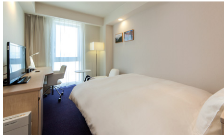
Comfort Room (20m 2 )