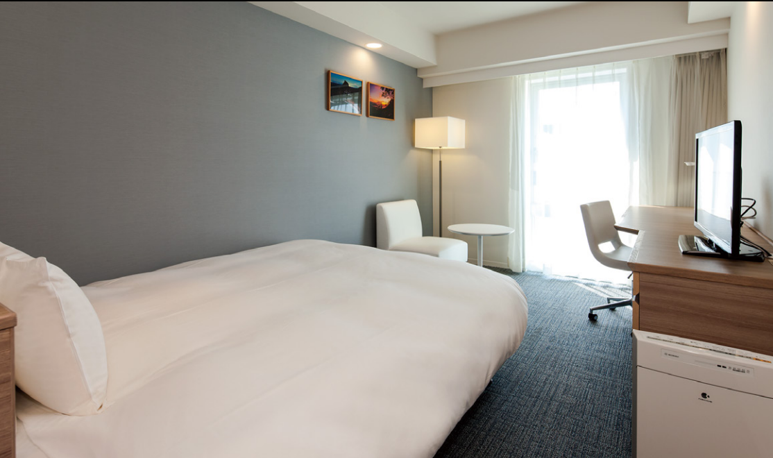
Standard Single Room (20m 2 )