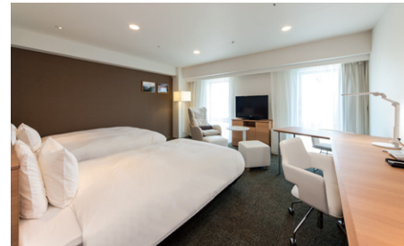
Superior Twin Room (38m 2 )