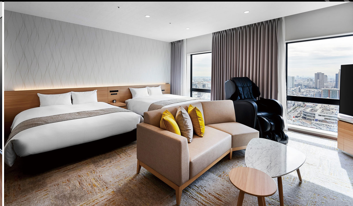
Junior Suite (46.1m 2 )

Amenities for kids (available at the front desk)