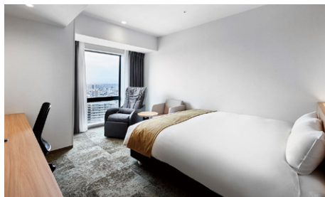
Deluxe Queen Room (25.2m 2 )