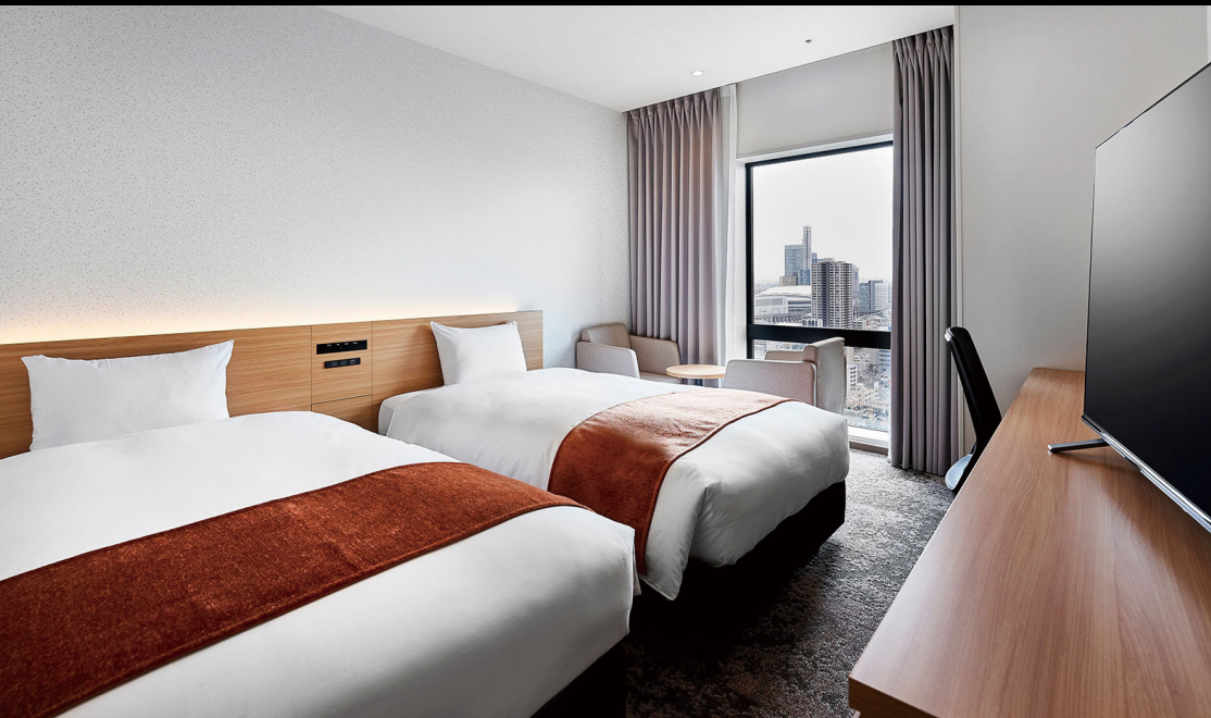
Moderate Twin Room (25.8m 2 )