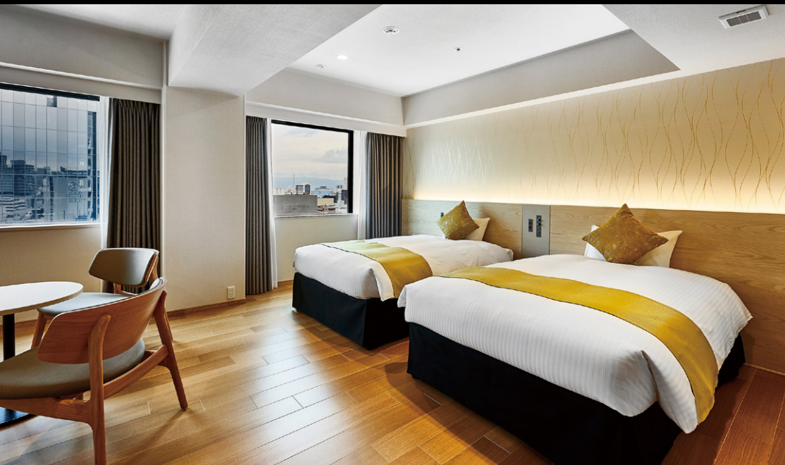
Style Twin Room - Twin Room with Wooden Floor - (38.4m 2 )