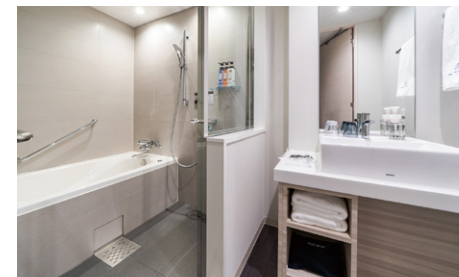
Separate toilet and bathroom (example)

All guest rooms have separate bathroom and toilet (except a universal room). You can enjoy a relaxing bath even when multiple guests are using the room.