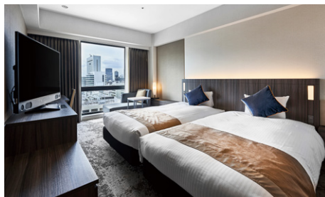
Hollywood Twin Room (26.4m 2 )