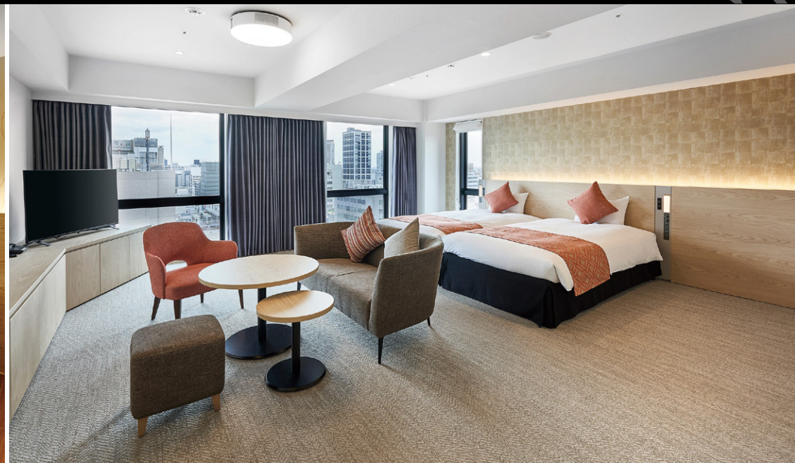
Junior Suite Room (52.9m 2 )

Amenities for ladies (available at the front desk) / Amenities for kids (available at the front desk)