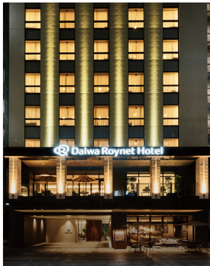
DEL style 大阪心斎橋