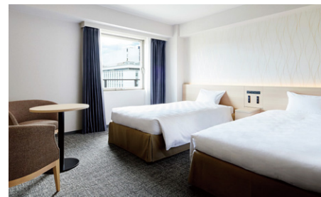
Superior Twin Room (28.6m²)