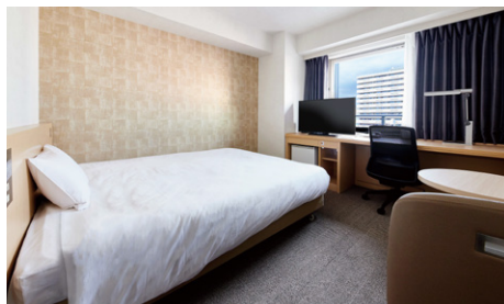
Superior Double Room (20.8m²)