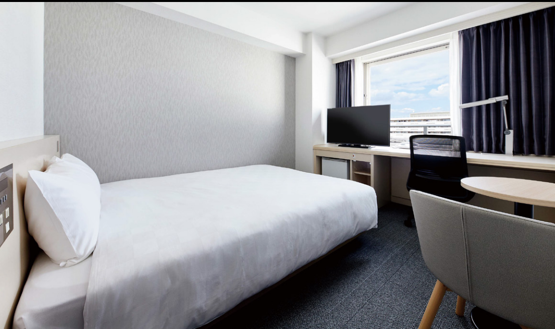
Standard Room (18.2m²)