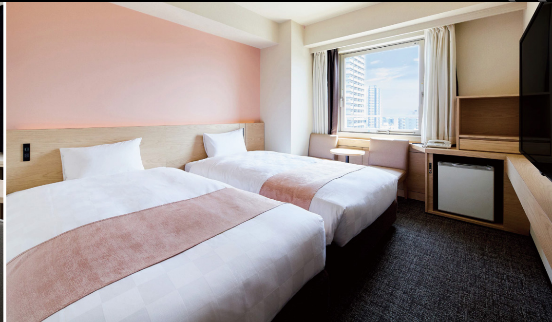
Corner Twin Room (20.8m²)