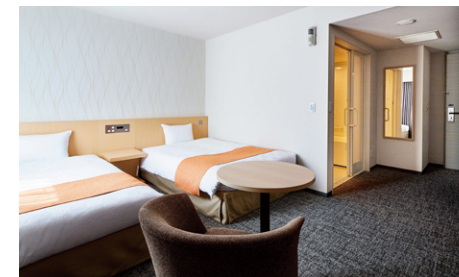
Universal Room (28.6m²)