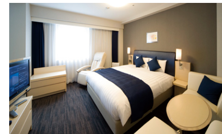
Deluxe Room (32m 2 )