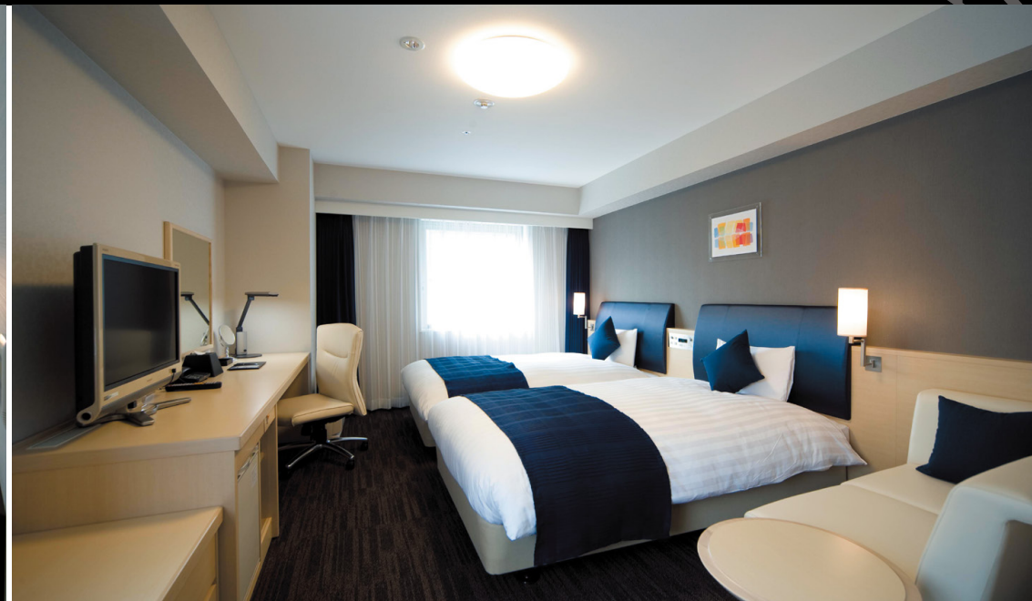
Twin Room (30m 2 )

Amenities for kids (available at the front desk)