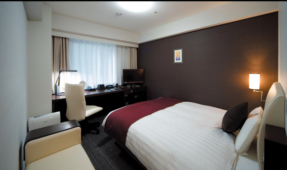
Standard Room (18m 2 )