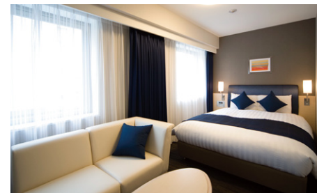
Moderate Room (21m 2 )