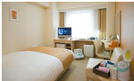
Ladies Room (20m 2 )