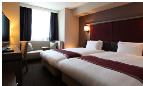
Twin Room (26m 2 )