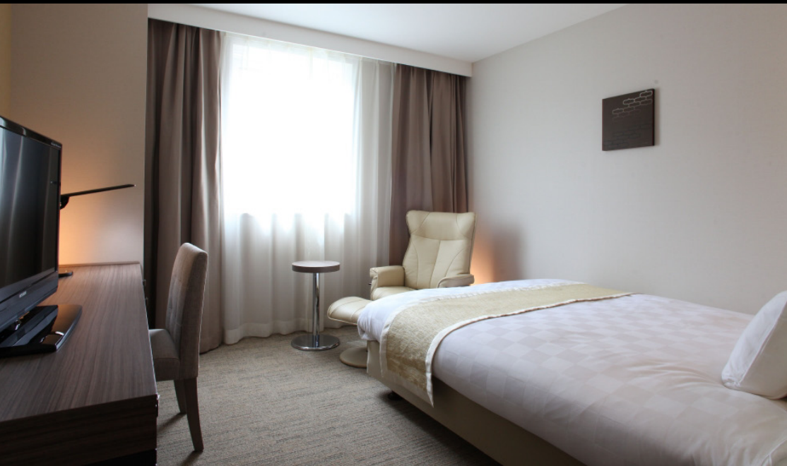
Standard Room (20m 2 )