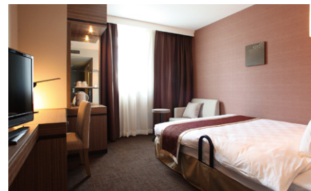
Heartful (Universal) Room (26m 2 )