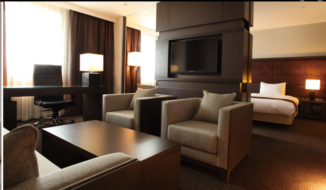
Executive Room (52m 2 )