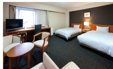
Triple Room (33m 2 )