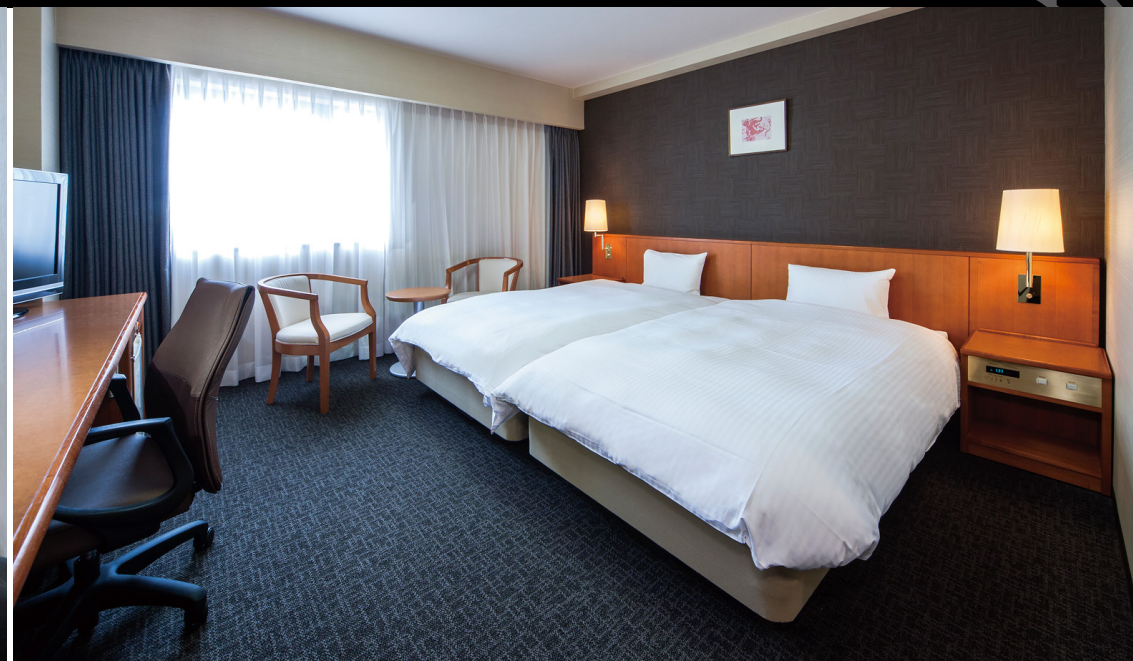
Hollywood Twin Room (27m 2 )

Amenities for ladies (available at the front desk) / Amenities for kids (available at the front desk)