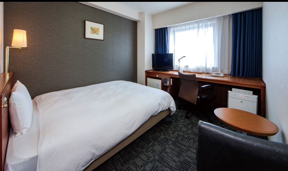
Single Room (18m 2 )