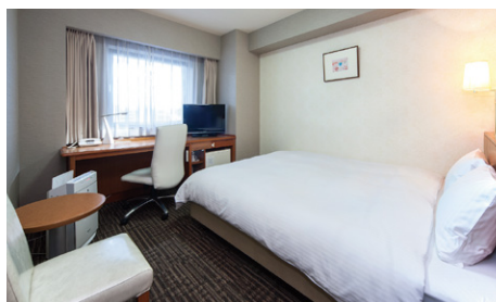
Double-B Room (20m 2 )