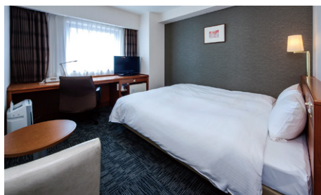
Double-A Room (18m 2 )