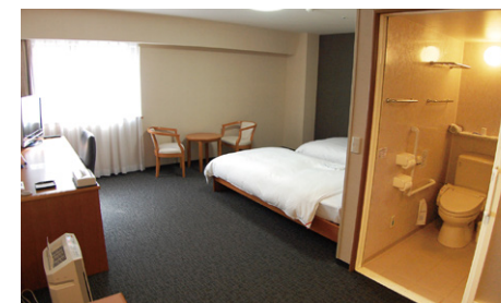
Universal Twin Room (33m 2 )