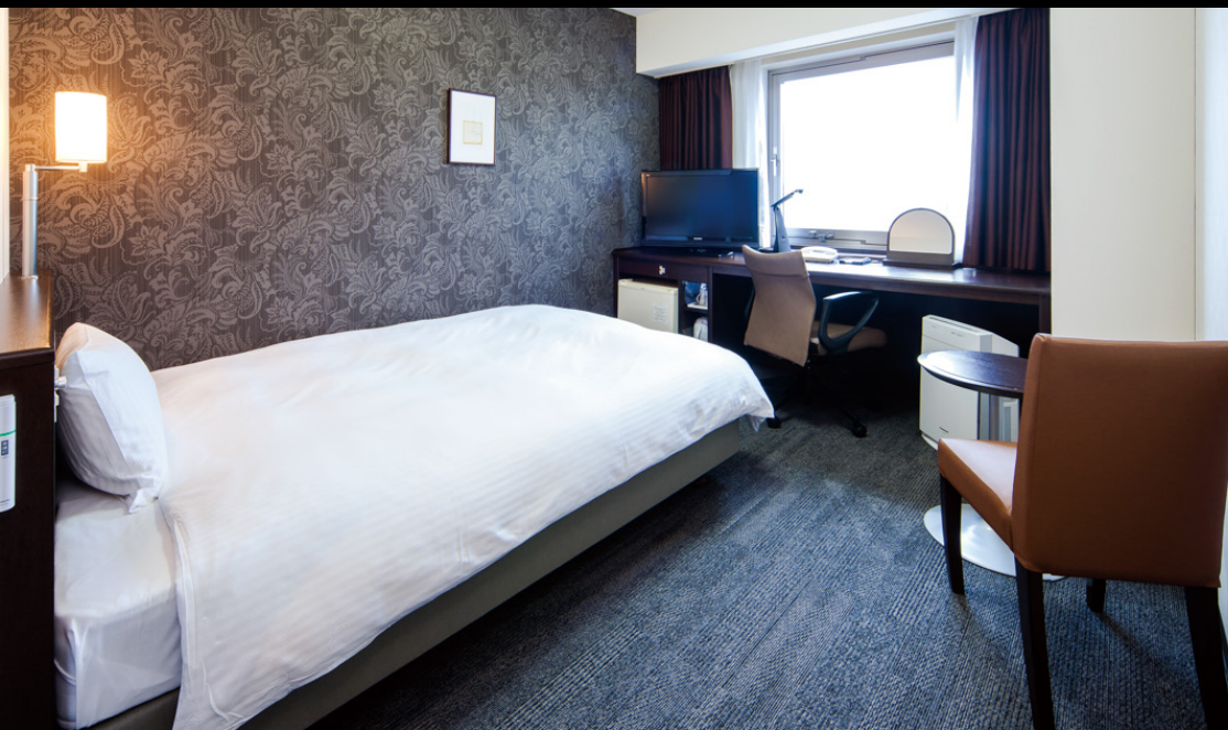
Standard Double Room (18.7m 2 )