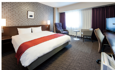
Moderate Double Room (26.3m 2 )