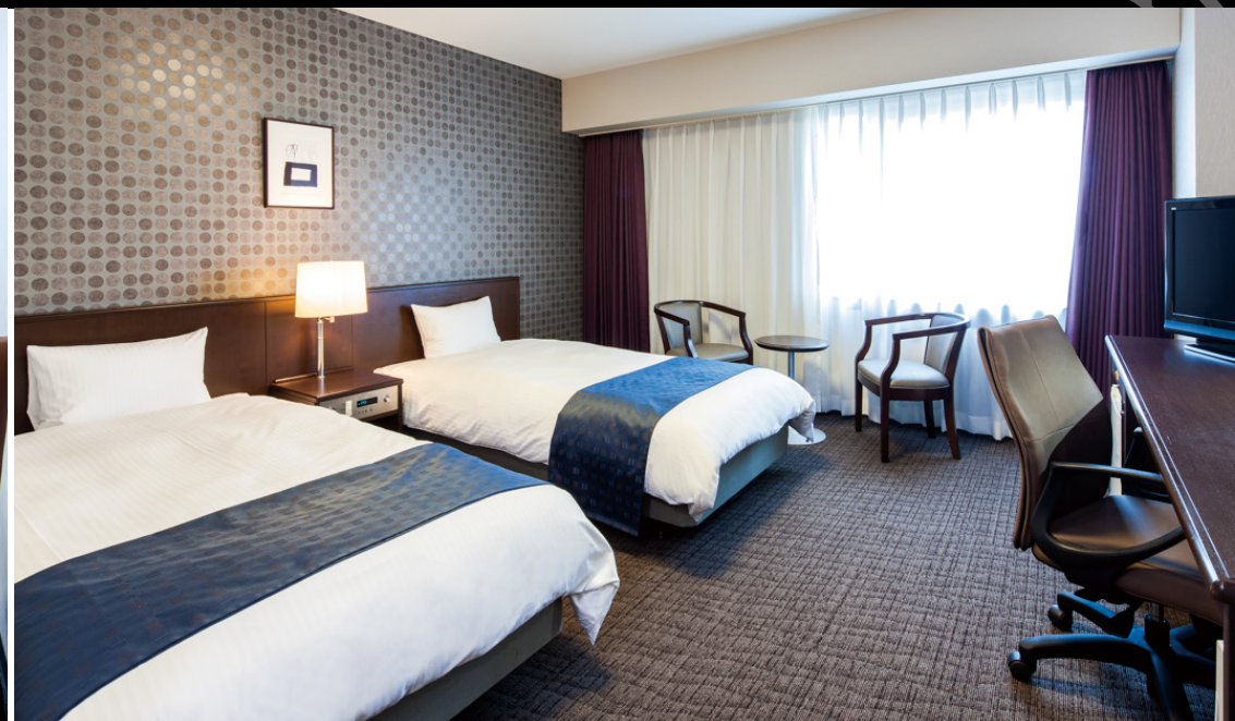
Standard Twin Room (26.8m 2 )