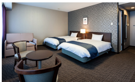
Triple Room (35.7m 2 )