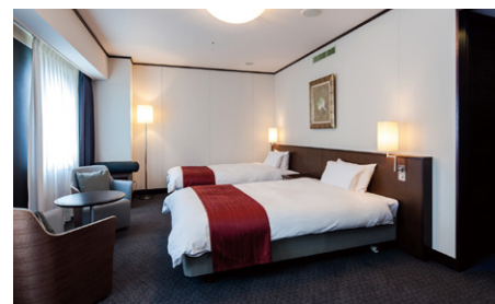
Deluxe Twin Room (71.1m 2 ) We also have multipurpose meeting rooms.