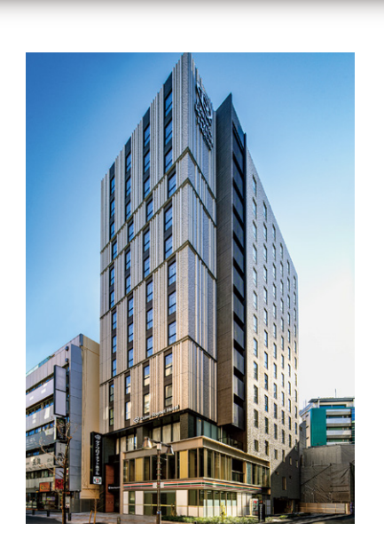
DEL style 池袋東口

Rich in arts and culture, lkebukuro offers a variety of events and numerous sightseeing and shopping spots. Ideally situated just a 2-minute walk from the East Exit (South) of Ikebukuro Station, DAIWA ROYNET HOTEL Ikebukuro Higashiguchi welcomes guests to a tranquil, high-quality space despite its location in the middle of a busy and bustling area.