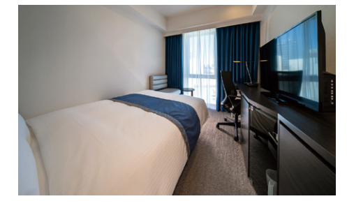
Moderate Double Room (18m²) with shower room