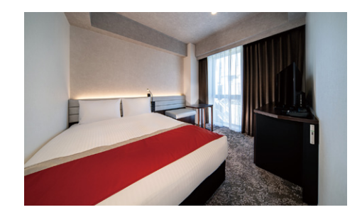
Moderate Double Room (18m²) with unit bath