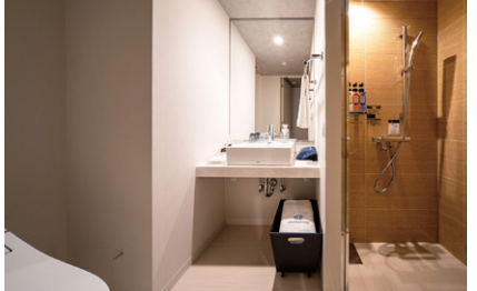
Moderate double rooms come in two styles, either with a unit bathroom or a shower room.