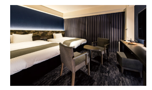
Deluxe Twin Room (30.9m<sup>2</sup>)

Other types of rooms: Executive double (40.1 m<sup>2</sup>), Universal double (23.9 m<sup>2</sup>) / Total 205 rooms