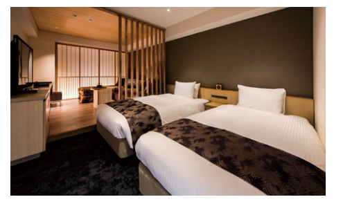
Executive Twin Room -Hana- (36.2m<sup>2</sup>)

Superior Twin Room - Miyabi- (24~26.6m<sup>2</sup>)