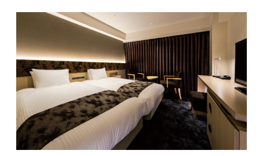
Standard Twin Room (23.7m<sup>2</sup>)